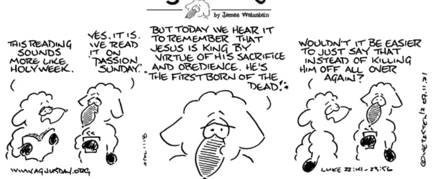
Agnus Day appears with the permission of www.agnusday.org