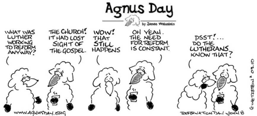
Agnus Day appears with the permission of www.agnusday.org