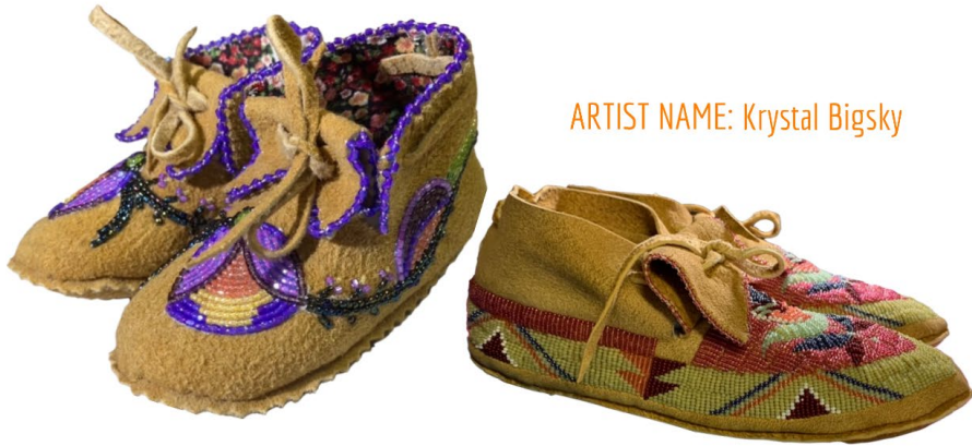
ARTIST NAME: Krystal Bigsky

THURSDAY, DECEMBER 9, 2021 - 6:30 PM TO 8:00 PM EST